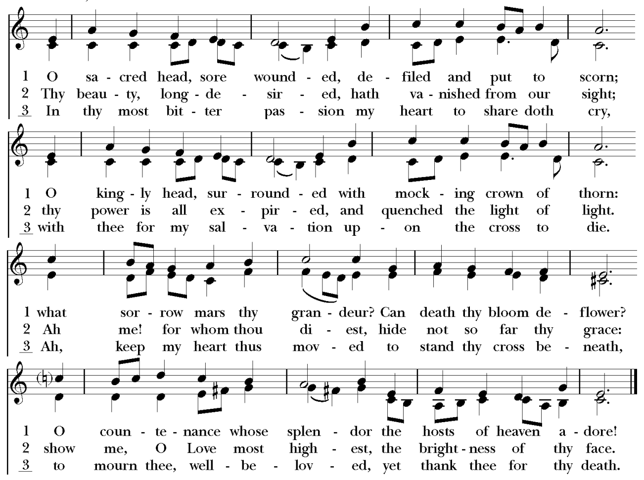
Hymn "O sacred head, sore wounded"