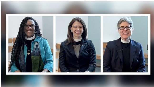
.McVean-Brown Raining Smith

Bring little bouquets for Easter as the children flower the cross.